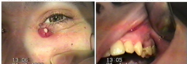
Picture no. 3. Case 8. Lacrimal and vestibular fistula

Regarding a 16 years-old girl, case 8, the tendency of abscess of sinusitis manifests itself in the ophthalmological as well as in the oral maxillary area. So, we can observe a fistulised dacryocystitis, as well as a vestibular fistula (Figure 3)